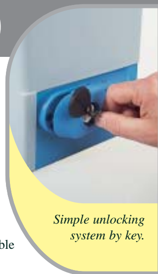
Simple unlocking system by key.