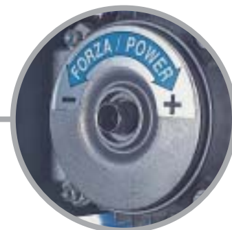
Anti-crushing safety thanks to the mechanical clutch.