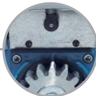
Integrated limit-switch in opening and closing.